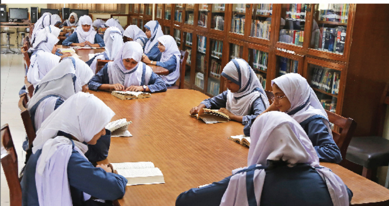
Place where books speak