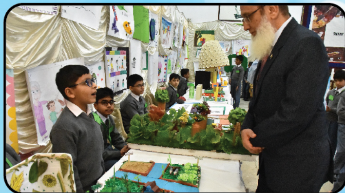
Exploring nature is fun. Art Exhibition from Primary Boys Morning