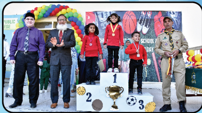
The Winners Receive The Medals