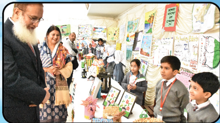
Change the world with the power of creativity. Art Exhibition