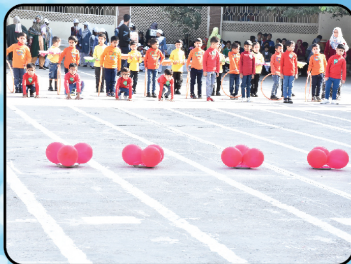
Races mean facing the challenge. Sports Gala