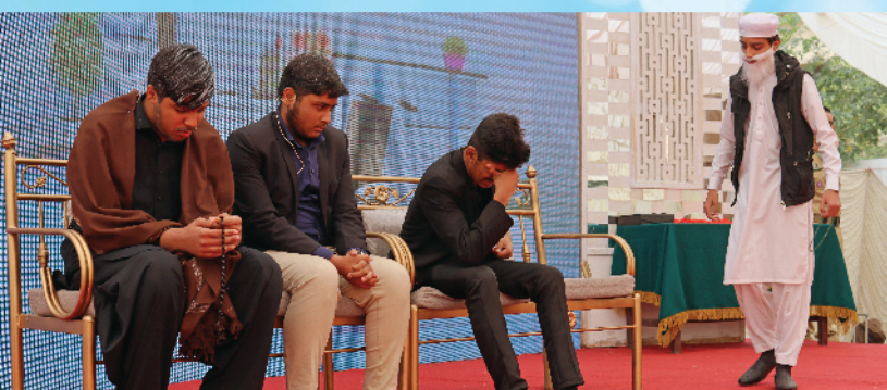
Glimpses Of A Tableau Performed By Secondary Boys.