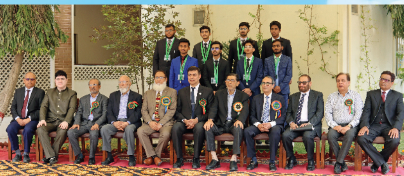
Silver Medalists Boys