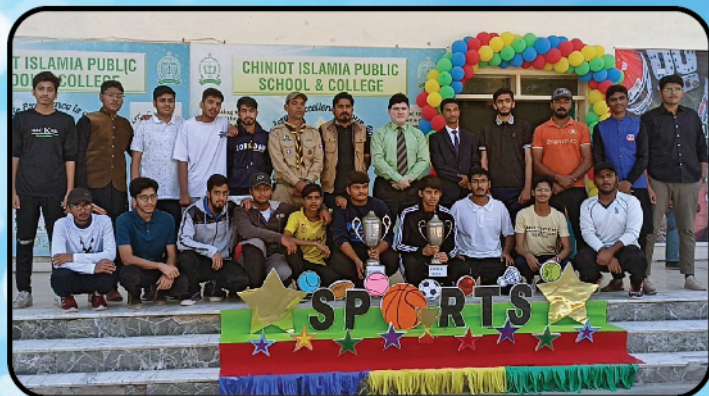
The Football Winners