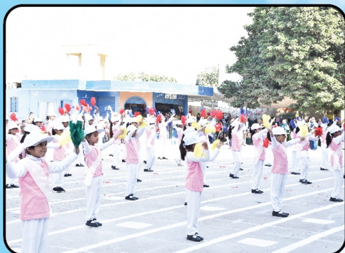
Calmness over chaos. PT Display from Primary Girls Afternoon