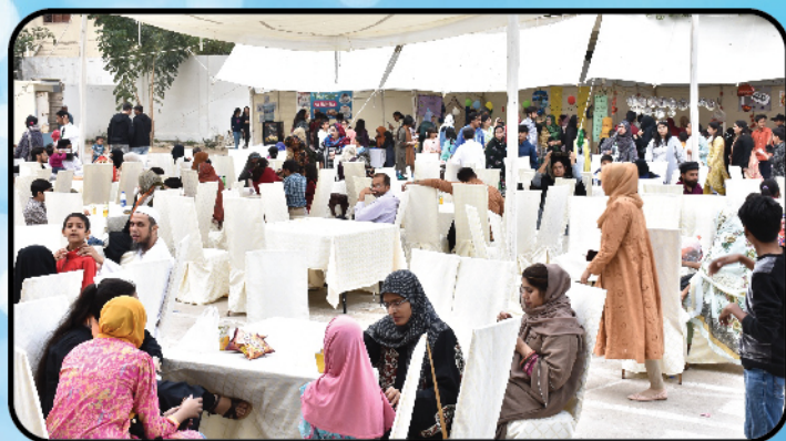
Stress less, enjoy the best. FunGala first time in the history of CIPS