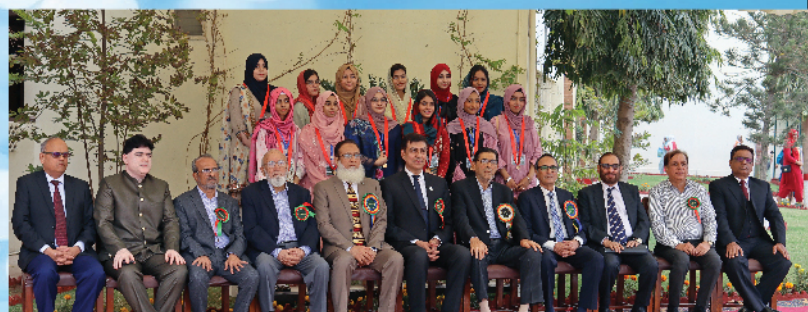
Proud Gold Medalists Girls