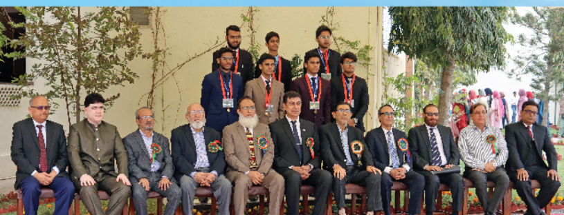
Proud Gold Medalists Boys