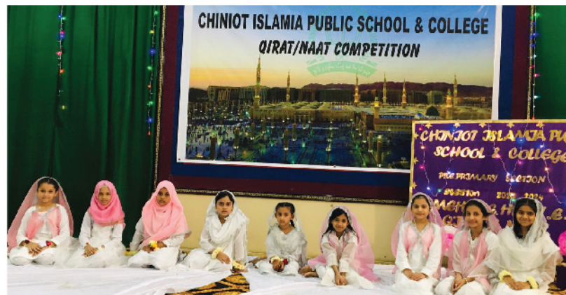
Stay True to your Brand voice, Naat competition