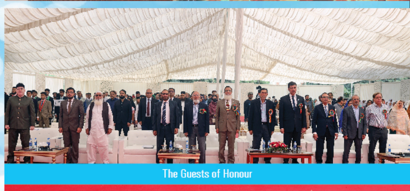
The Guests of Honour