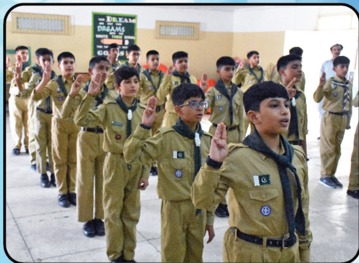
Boys Getting Ready for Summer Camp