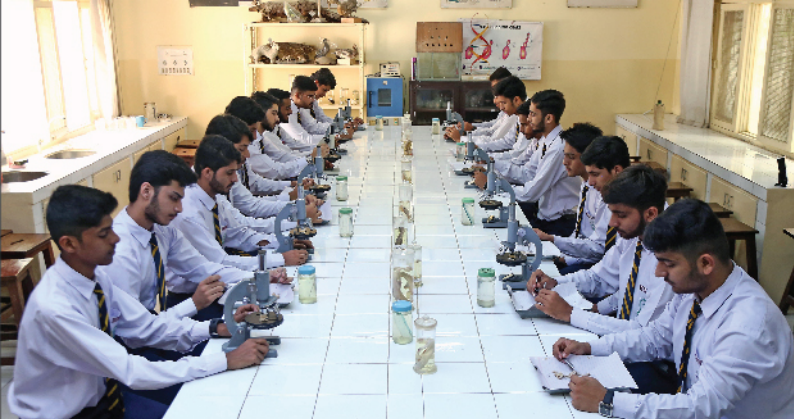
Labwork is an emotion Students are performing task through microscopes.