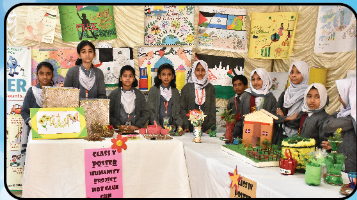
A Showcase of Arts Projects from Primary Girls Afternoon