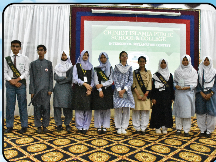
Let the speech be better than silent. Declamation contest 2024