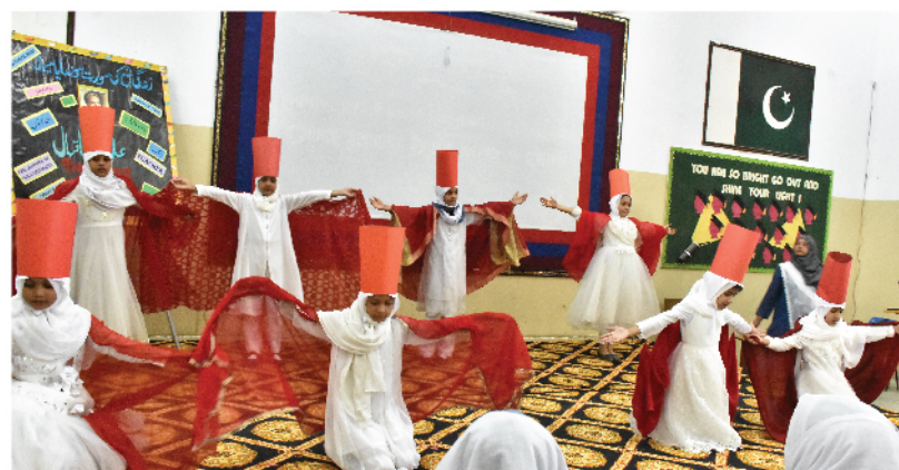
A tableau on Kalam-e-Iqbal from Primary Girls Afternoon