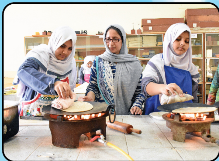
Summer camp Roti making experts