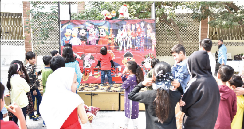
Puppet show in FUNGALA.