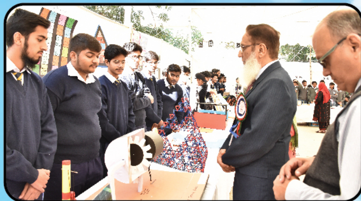
Add value, educate, inspire inform. Science Exhibition