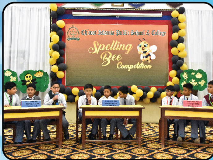
Participants of Primary Section