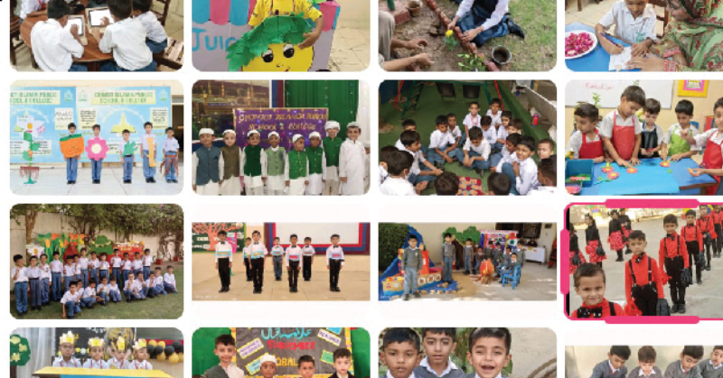
Glimpses of activity of Pre-Primary Students