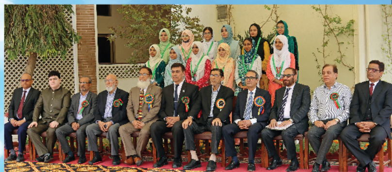
Silver Medalists Girls