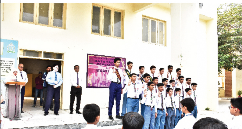
A little contour and confidence, Oath taking ceremony