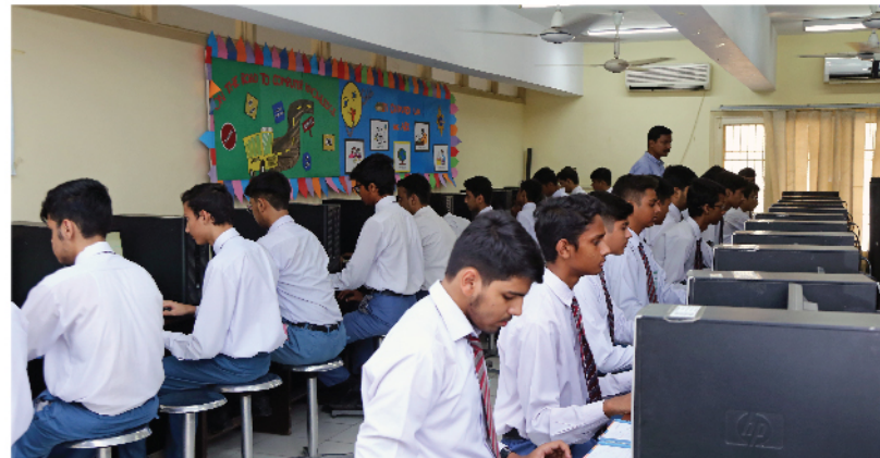
Students learning IT skills