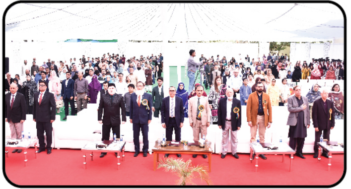
Hearts filled with pride as we stand for our anthem.