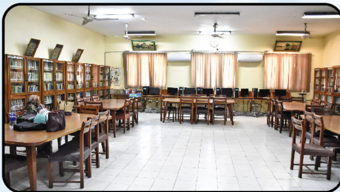
The school maintains a spacious, air-conditioned library with over 12,800 books, covering general and subject-specific disciplines and organized according to the Dewey Decimal System.