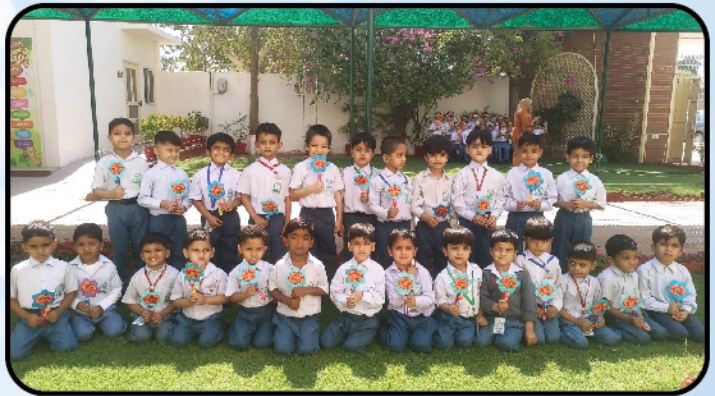
Celebrating creativity, curiosity, and confidence.