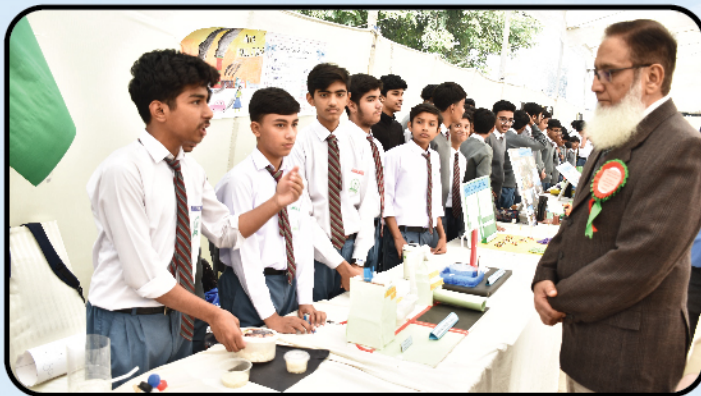
Proudly showcasing the technical and scientific talents of our students.