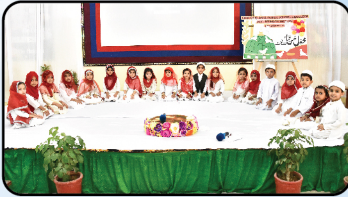
A gathering of faith, peace, and unity. Celebrating Eid Miltad un Nabi SAW