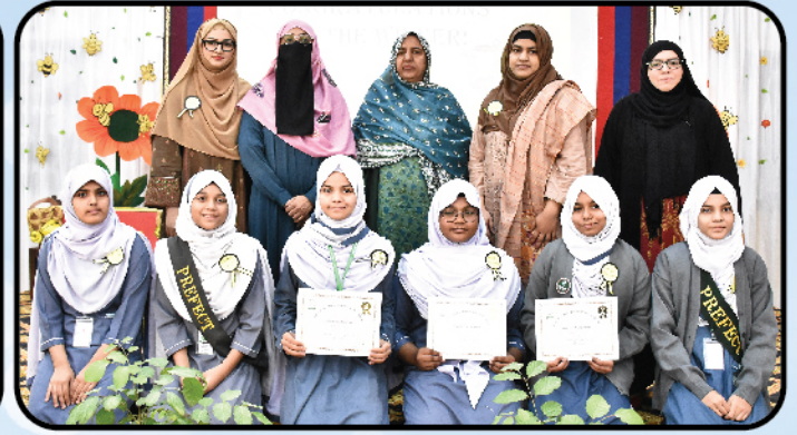
A spiritually uplifting and peaceful occasion.