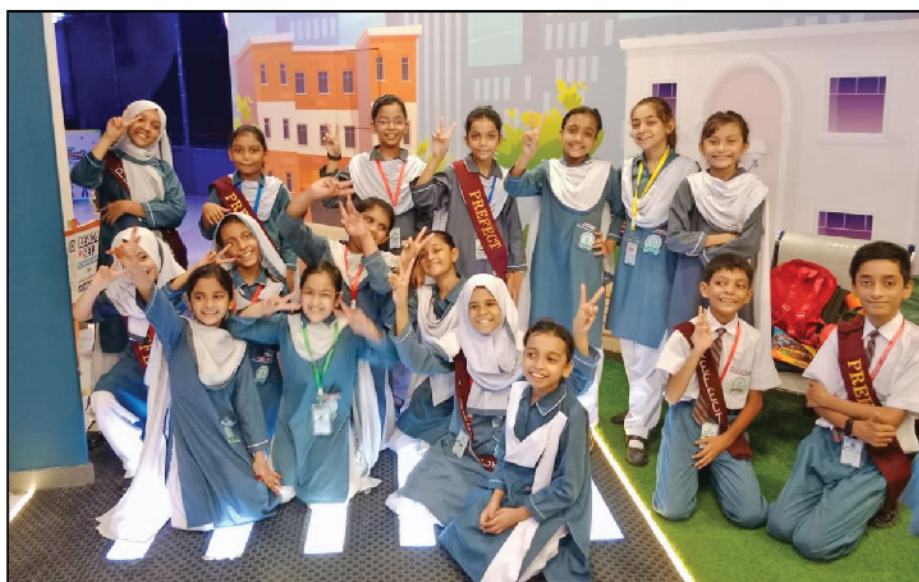
Learning today, leading tomorrow. A wonderful experience to TDF MagnifiScience

Educational trips and excursions to places of educational interest are arranged by the school. The students proceeding on such trips are required to wear neat and clean uniforms.