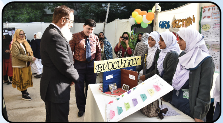
An exhibition reflecting excellence in science and technology.