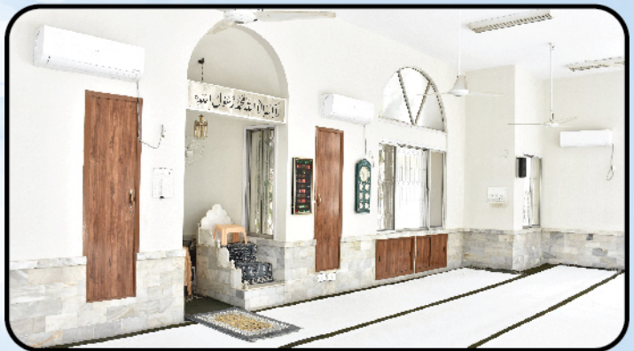
The school has a fully functional, air-conditioned Jamia Masjid that also serves the nearby community.