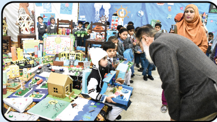
Colors that speak louder than words Art Exhibition