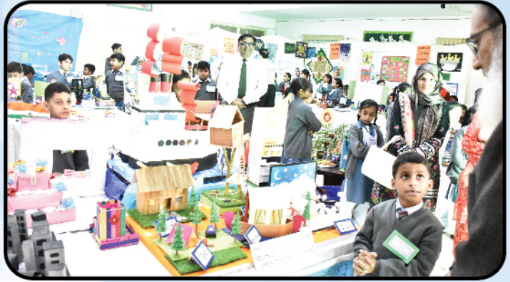
An inspiring art exhibition highlighting students' creativity.