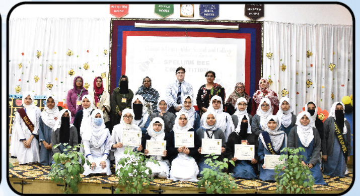
Applauding accuracy, confidence, and excellence in spelling.