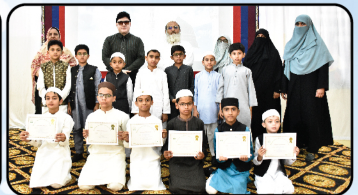
A spiritually enriching and peaceful gathering.