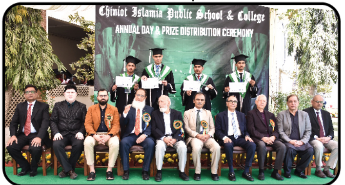
Honoring our Silver Medalists Boys for their outstanding achievements.