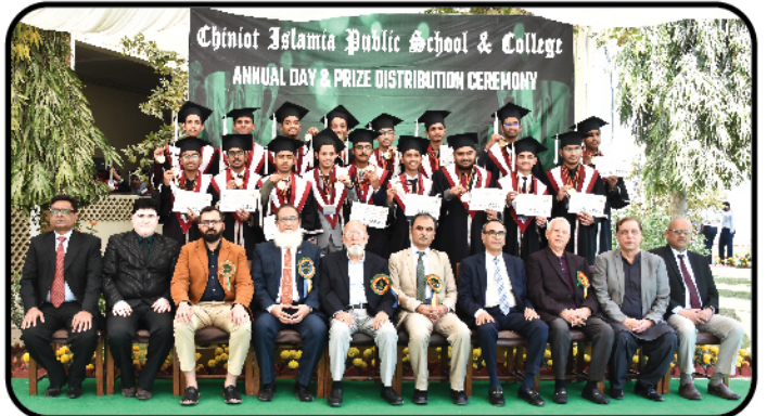
We proudly congratulate our Gold Medalists Boys on their remarkable accomplishment.