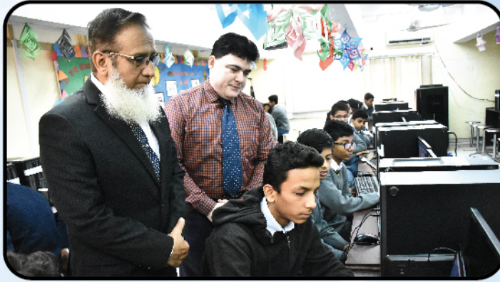
A proud moment honoring excellence in research, creativity, and technology.