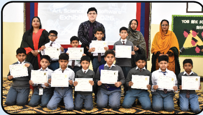
Celebrating young innovators shaping the future with their ideas.