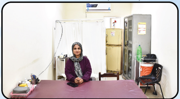
A well-equipped, air-conditioned sick room, managed by a highly experienced and qualified nurse, ensures prompt care for medical emergencies. The facility caters to all emergency situations and first.