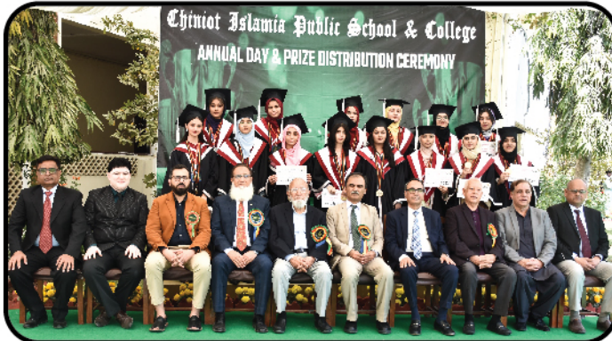
We proudly congratulate our Gold Medalists Girls on their remarkable accomplishment.