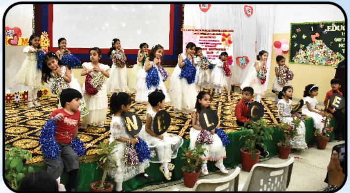
Smiles, curiosity, and creativity in action. A tribute to all mothers