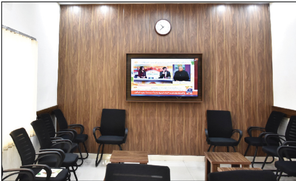
Information & Meeting Room For Parents & Visitors