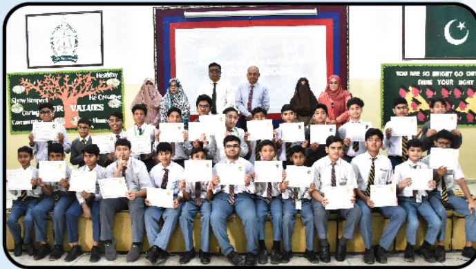
Applauding creativity and scientific brilliance!