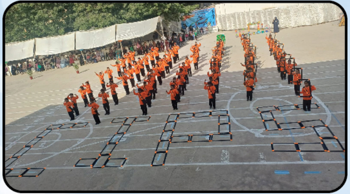
From classrooms to playgrounds, our students shine everywhere. Annual Sports Day