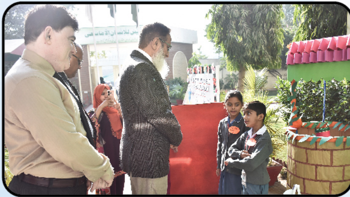
A vibrant display of creativity and expression. Art Exhibition