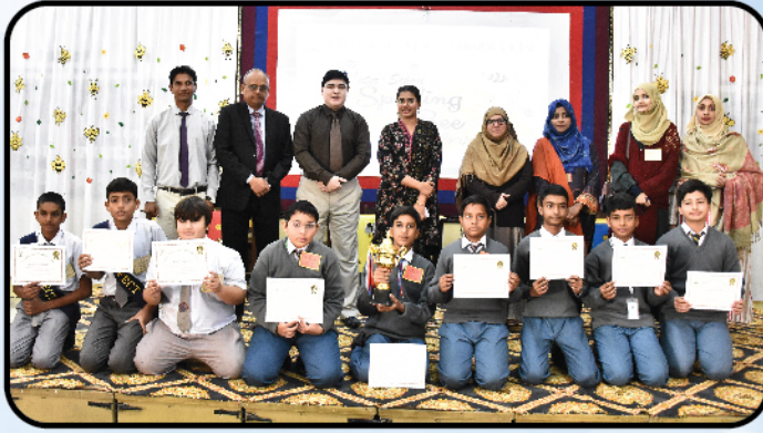
A fantastic display of vocabulary and determination.