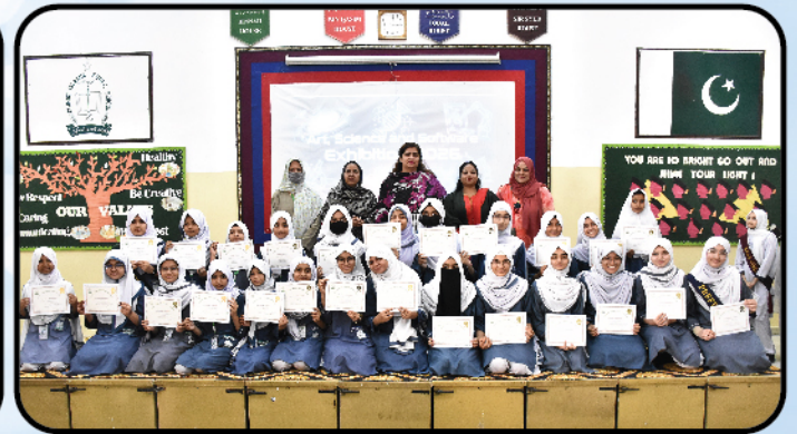
Excellence in science and technology.