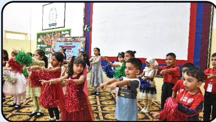
Little stars shining in every field