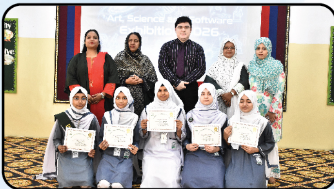
Encouraging curiosity, creativity, and discovery.