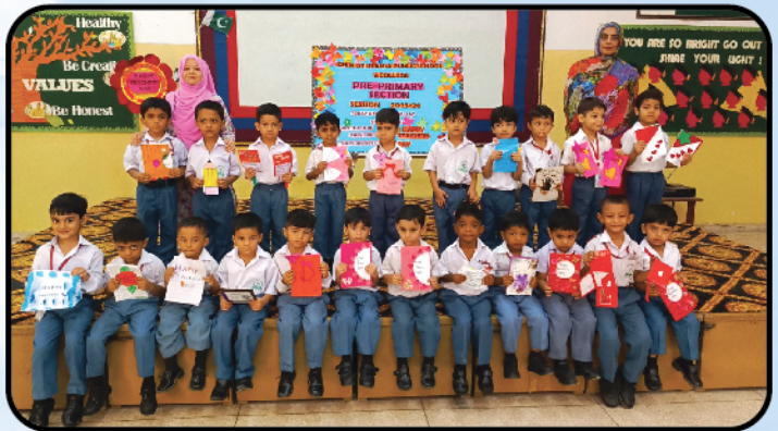
Behind every successful student is a dedicated teacher.